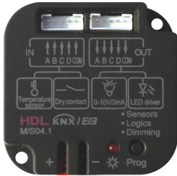
Figure 1. KNX 4-Zone Dry Contact Module

Datasheet Issued: June 17, 2019 File Edition: V1.0.0