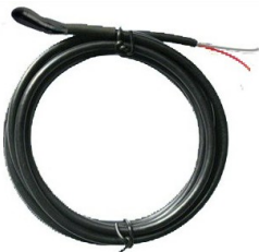
Figure 3. Temperature Sensor (TTS/APR1.0)